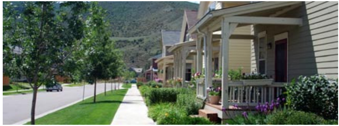
The mission of the Eagle County Housing Department is to provide innovative, affordable housing solutions to the working people, elderly and disadvantaged members of the Eagle County community.